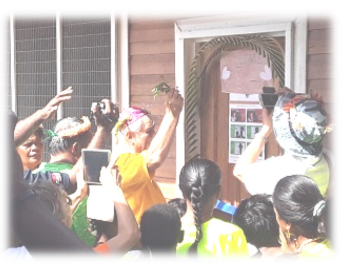
The pictures illustrate the day June 13, 2020

merge. The people of the diocese of Gizo have new school is located at the hill top known as been blessed and witness to what is often heard, 'millionaire point', now re-baptized with a Christian name of NUSA-BOSCO